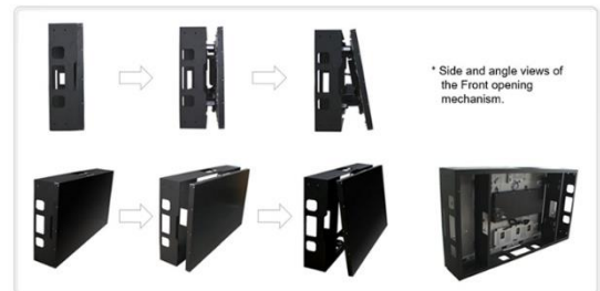
* Side and angle views of the Front opening mechanism.